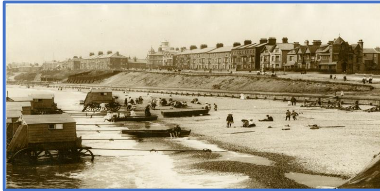
Seaside holidays in the UK during Victorian times

Transport – People travel by train, car, boat or plane to their seaside holiday.