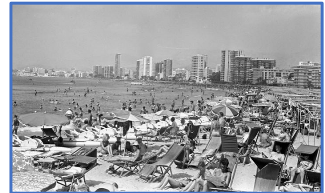
Seaside holidays abroad today