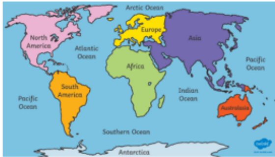
Continents and Oceans